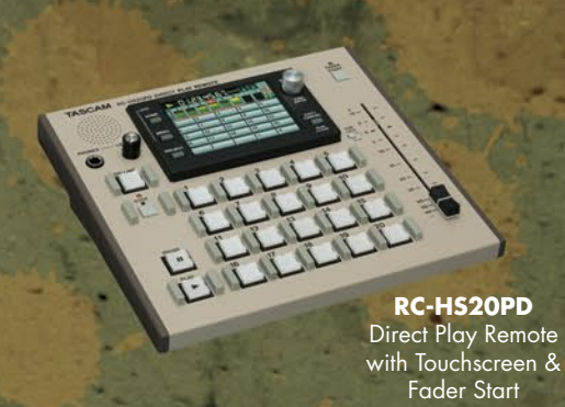
Pictured with optional SY-2 synchronization card installed