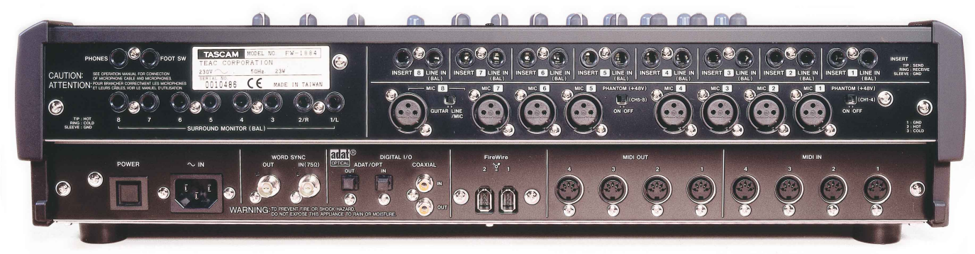
Phantom power for the FW1884's eight mic preamps is switched in two banks of four.

The Record Ready LEDs serve a dual function: when the FW1884 is being used with a computer, they do exactly as you'd expect, showing you which channels are armed for recording. However, in Monitor mode, the position of the illuminated LEDs along the row of eight indicates the value of the pan control for the selected channel, where having the middle two LEDs lit signifies the pan is set