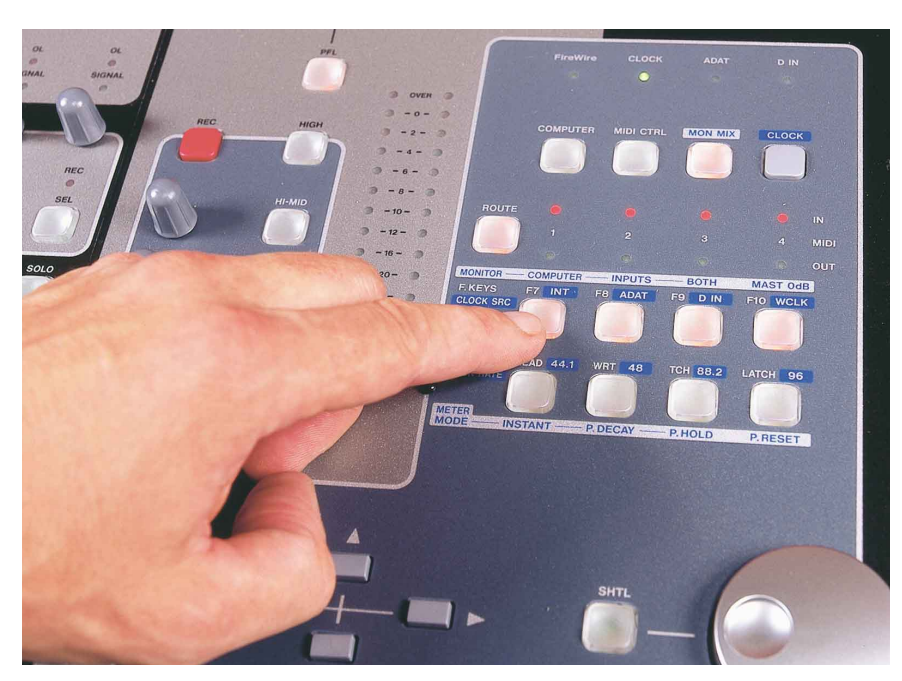
The FW1884 and host sequencer can be switched between different automation modes at the touch of a button.

Installing the software involves a general driver installation plus plug-ins for whichever host software you plan to work with. There are also ASIO drivers for the different OS platforms. The basic install is automatic, but with the pre-release software I was working with, the plug-in had to be placed in the host software's control surface plug-in folder manually. Though the connection is by Firewire, the driver software interfaces with the host's internal MIDI routing for the purpose of sending and receiving control information, so in addition to the four physical MIDI ports, there's one further virtual MIDI port that needs to be set up as the In and Out source for your sequencer's control surface setup page. This had me fooled for a while in Logic Audio where I reviewed the FW1884 under OS X, but as soon as I twigged what was going on (or in this case, wasn't!) and selected the FW1884's control port in and out, everything worked flawlessly. The FW1884 runs under OS 9 too, but then you have to route MIDI via OMS — which worked fine